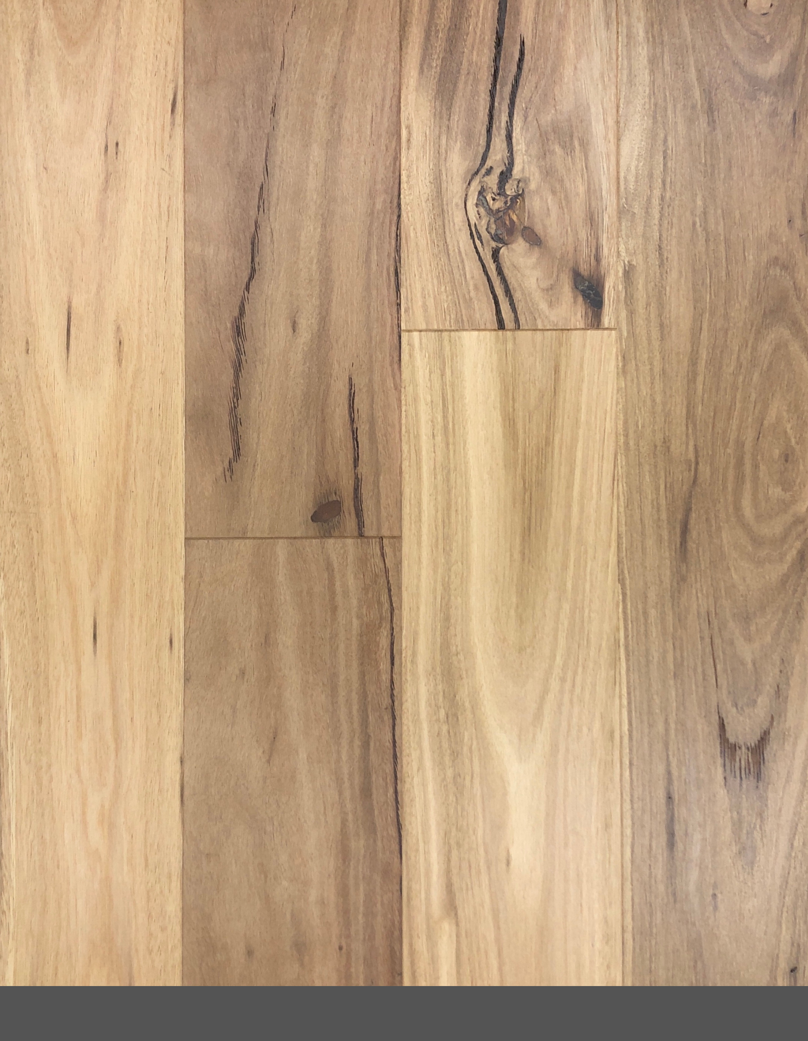
Blackbutt Rustic Matt