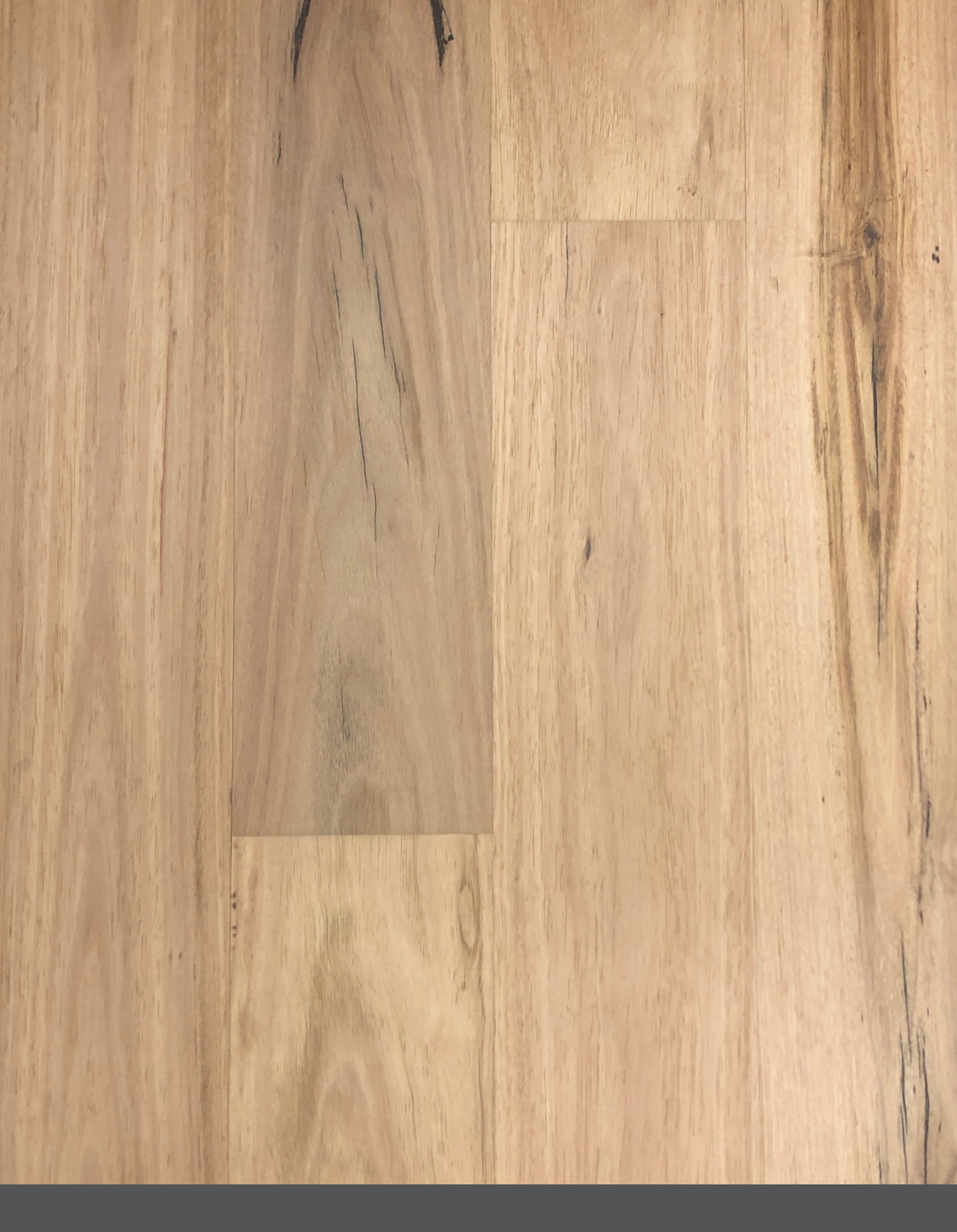
Blackbutt Brushed Matt